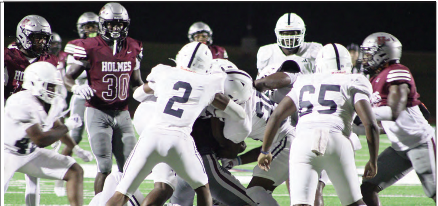
“Bears on the Prowl”