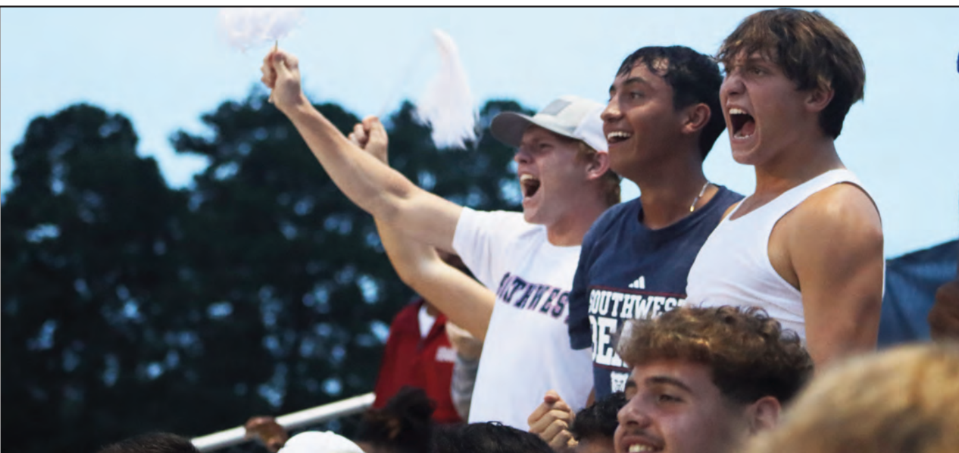
“Make Some Noise”