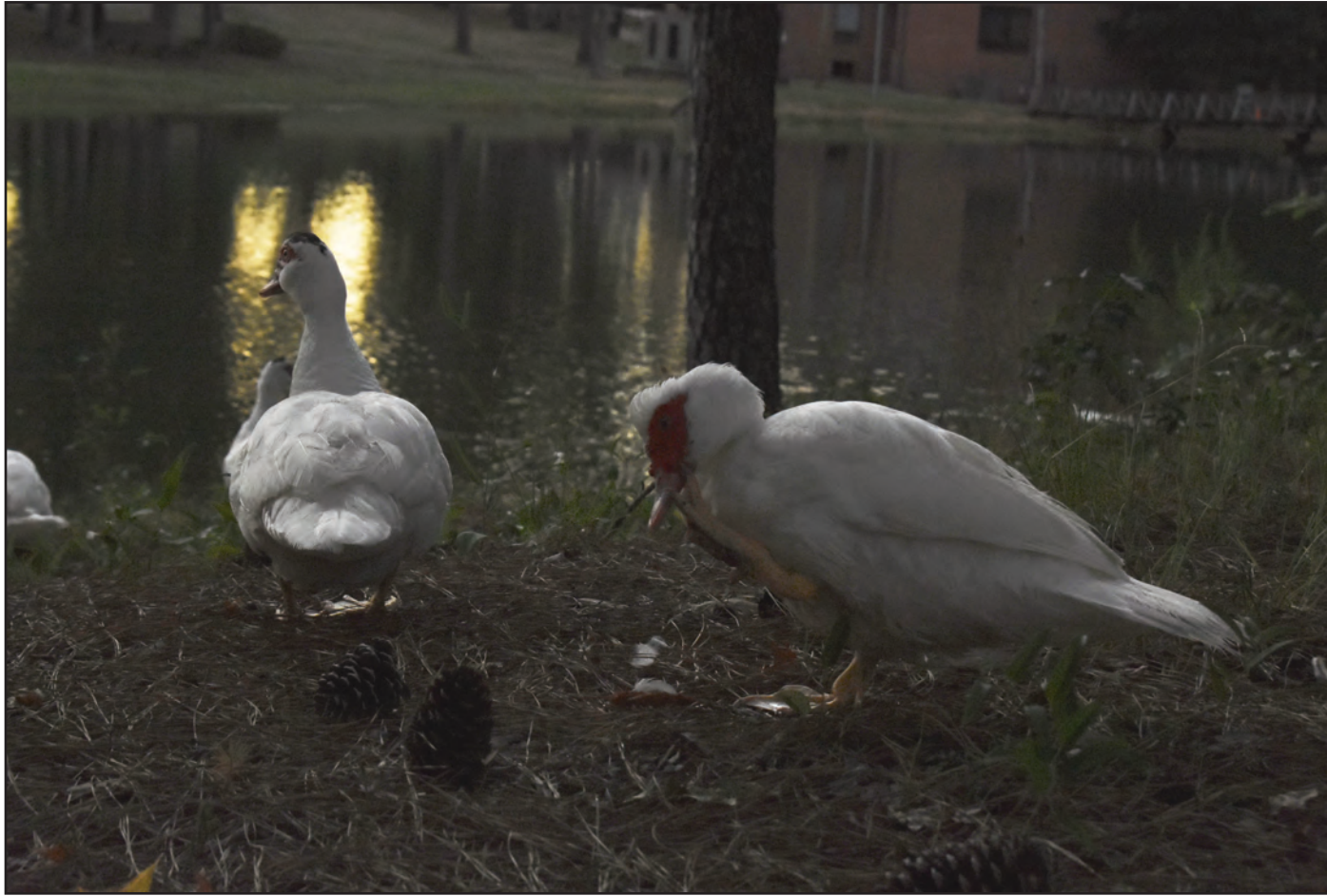
Dreaming of an A