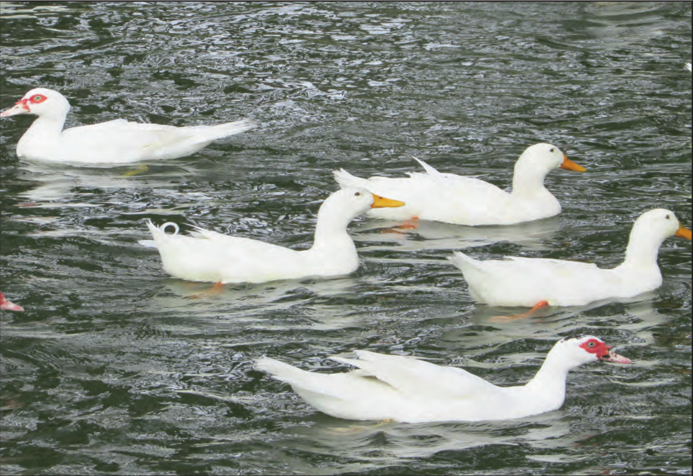
Back Together Again